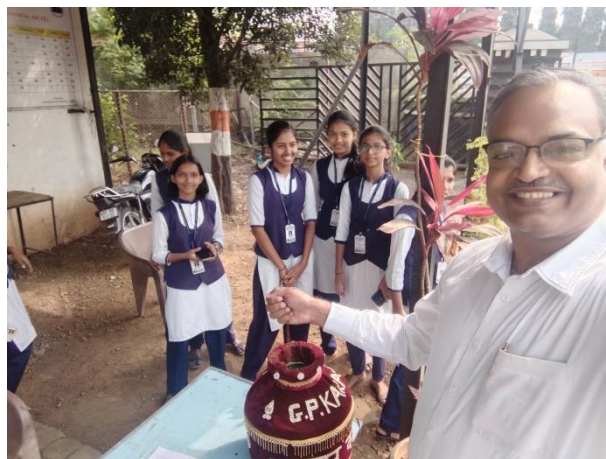
Participation in 'Meri Mati Mera Desh' abhiyan