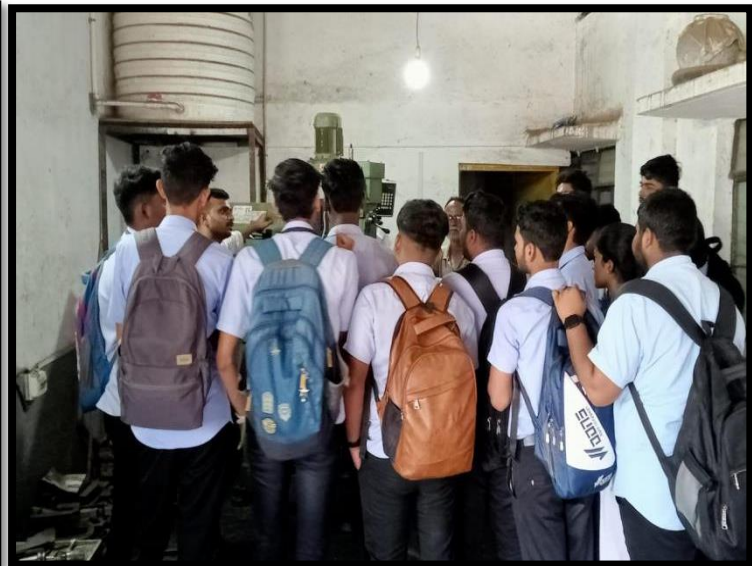
X,Y Engineering Works, Ogalewadi MIDC