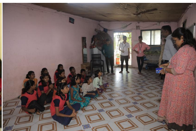
Children's day and Diwali Celebration by MKSA students with Children of Orphanage

In line with the Meri Mati Mera Desh” nationwide initiative to commemorate 75 years of India’s Independence, all the students and staff of Mechanical Engineering participated in collecting the soil of our campus and also uploaded the selfies on the given website.