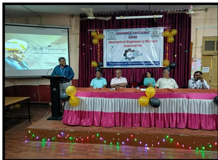
Poster Presentation Exhibition and Logo Competition organised by MESA