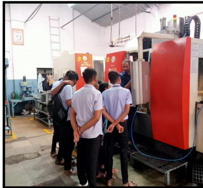
Kalburgi Stamping, Ogalewadi MIDC, Karad